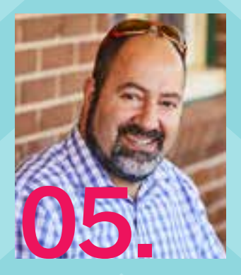
Q&A with our CFO