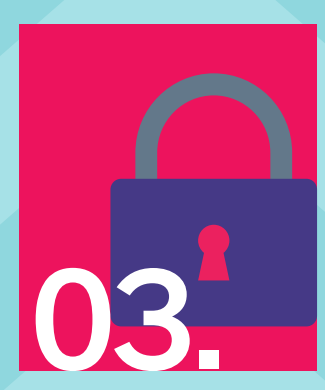
Managing your card and pin security