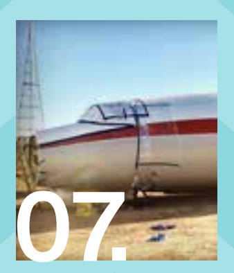
Celebrating 100 years of Qantas