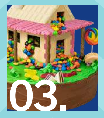
Low Cost Home Loan (Value Package)