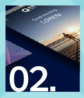
Coming Soon - our new mobile app