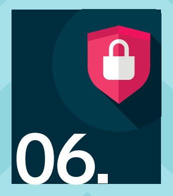
Around the traps: Combating fraud