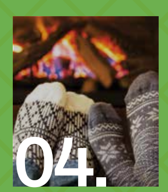
Tips on buying a home in winter