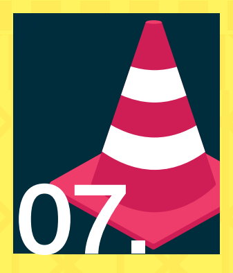
Protect yourself against card fraud