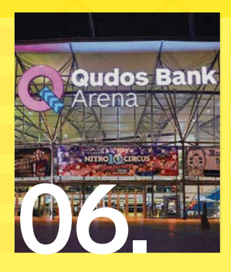
Welcome to Qudos Bank Arena