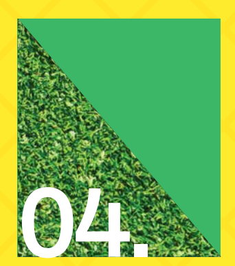
myQ going 100% digital